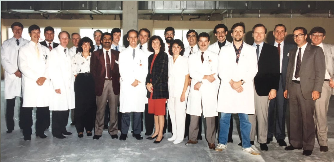
Staff, faculty and donors gather in the empty fourth floor of the Heritage Medical Research Building to kick-off the construction of the McCaig Centre for Joint Injury and Arthritis Research. 1989