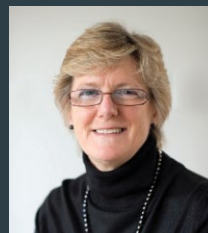
Professor Dame Sally Davies

Chief Medical Officer for England and Chief Medical Advisor to the UK Government