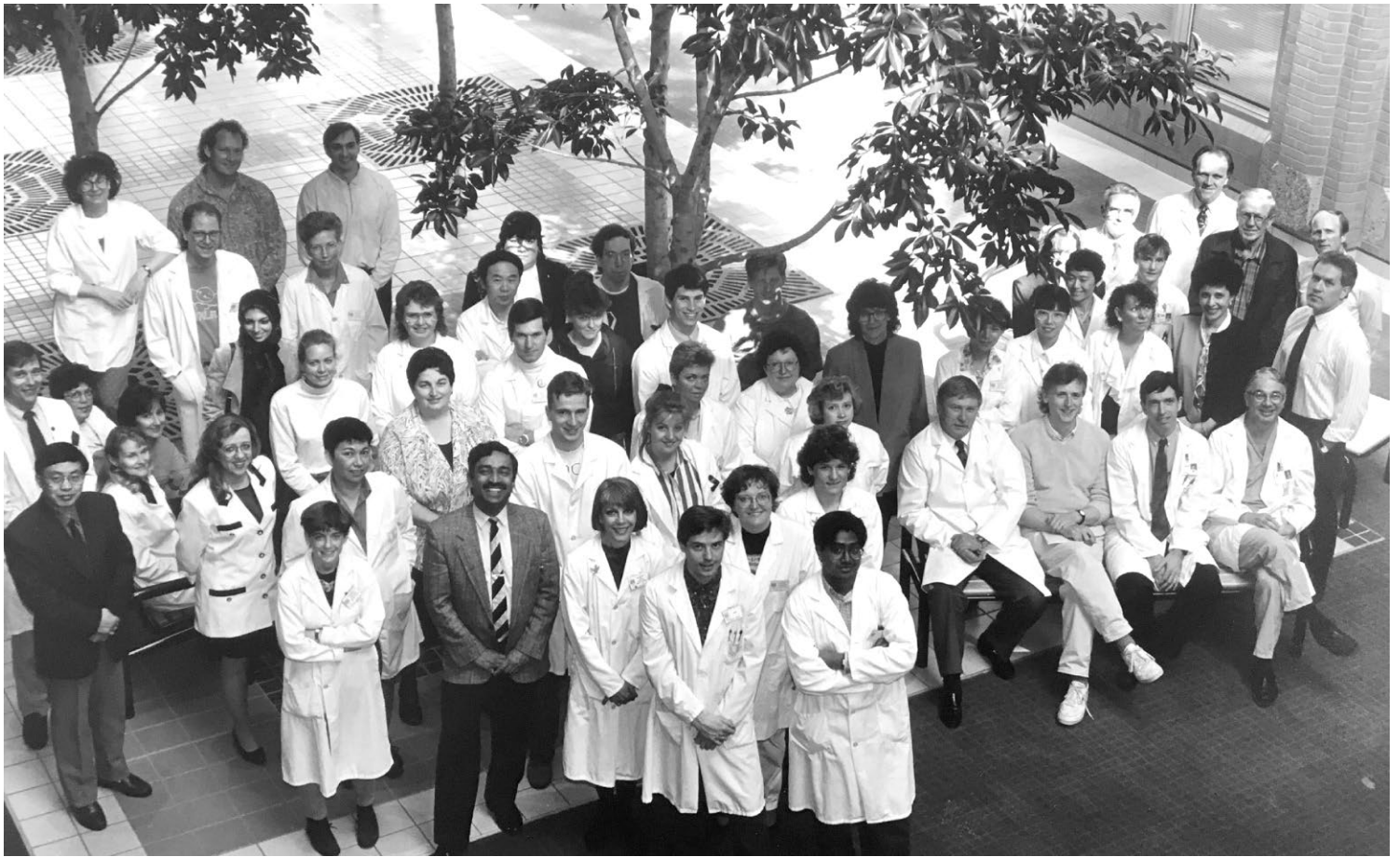
Members of the Joint Injury and Arthritis Research Group (JIARG), circa 1994

The campaign was a tremendous success, raising over $4.5 million. Construction began on the space and in the spring of 1992 the McCaig Centre for Joint Injury and Arthritis Research officially opened.